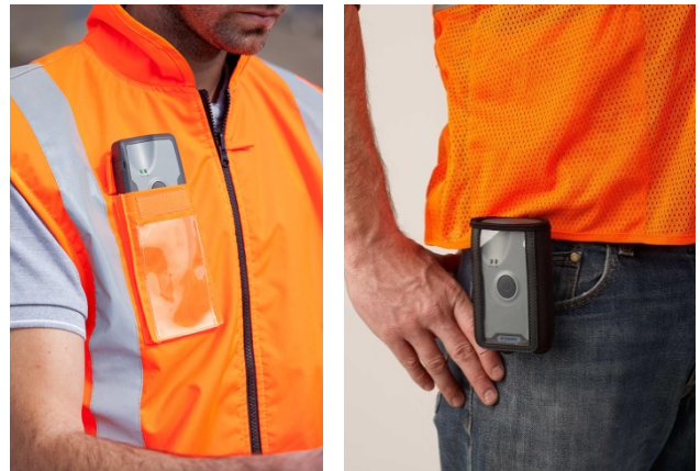
The Trimble R1 receiver can be transported in a vest, jacket pocket, or clipped to a belt when not in use.

Each of these features is important, especially when seeking a device that can withstand the elements where GIS professionals often work. The Trimble R1 is designed to deliver accuracy in a small, lightweight and rugged form factor.