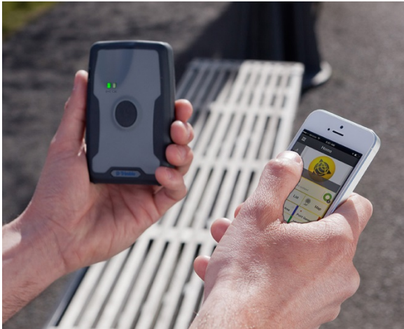
The Trimble R1 receiver can be shared among multiple devices.

The R1 GNSS receiver is designed to be compatible with a variety of smart devices and, due to its wireless Bluetooth connectivity, can be easily shared among multiple devices. As the investment into accuracy is made with the receiver, that investment is not lost when the smartphone or tablet gets damaged or when it is simply time for an upgrade of the smart device. The replacement device quickly and easily pairs with the Trimble R1 to take advantage of its higher accuracy.