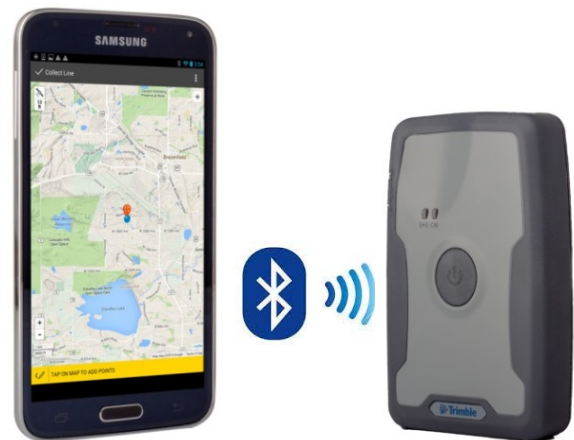
The Trimble R1 receiver connects wirelessly to a smart device via Bluetooth connectivity.

In this situation, using the Trimble® R1 GNSS receiver would address the accuracy limitations of a smartphone or tablet. This small, compact professional-grade receiver provides sub-meter location data directly to the smart device via Bluetooth®. By simply pairing the device with their smartphone or tablet, GIS professionals can get the accuracy needed to quickly and reliably locate their asset, collect data and move on to the next task.