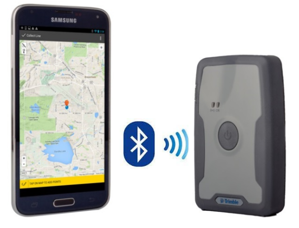
The Trimble R1 receiver connects wirelessly to a smart device via Bluetooth connectivity.

In this situation, using the Trimble<sup>®</sup> R1 GNSS receiver would address the accuracy limitations of a smartphone or tablet. This small, compact professional-grade receiver provides sub-meter location data directly to the smart device via Bluetooth<sup>®</sup>. By simply pairing the device with their smartphone or tablet, GIS professionals can get the accuracy needed to quickly and reliably locate their asset, collect data and move on to the next task.