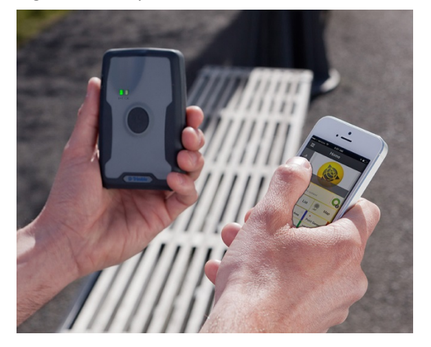
The Trimble R1 receiver can be shared among multiple devices.

The R1 GNSS receiver is designed to be compatible with a variety of smart devices and, due to its wireless Bluetooth connectivity, can be easily shared among multiple devices. As the investment into accuracy is made with the receiver, that investment is not lost when the smartphone or tablet gets damaged or when it is simply time for an upgrade of the smart device. The replacement device quickly and easily pairs with the Trimble R1 to take advantage of its higher accuracy.