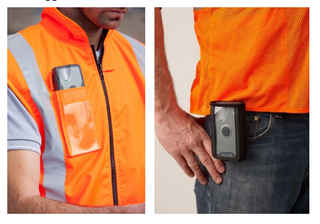
The Trimble R1 receiver can be transported in a vest, jacket pocket, or clipped to a belt when not in use.

Each of these features is important, especially when seeking a device that can withstand the elements where GIS professionals often work. The Trimble R1 is designed to deliver accuracy in a small, lightweight and rugged form factor.